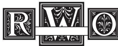
MFC Elmstead Split-Cameo Typeset any combination of Cameo Capitals and lowercase to your needs