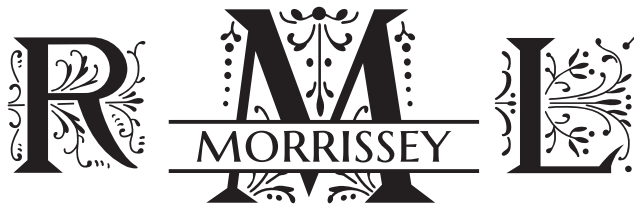
MFC Elmstead Split-Regular

The MFC Elmstead Split family comes complete with a customized version of Marcellus Pro, by our sister foundry Stiggy & Sands, in which the typeface has been setup as a smallcaps, numerals, and basic punctuation only font, scaled down to perfectly layer in position and combine with the MFC Elmstead Split typefaces. All you need to do is horizontally center the TinyCap text.