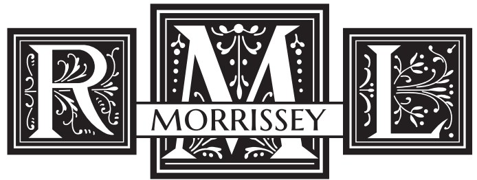
MFC Elmstead Split-Cameo

Typeset any combination of Capitals and lowercase to your needs. Duplicate a copy of the font above, change the font to the TinyCap style, and type your desired text and center.