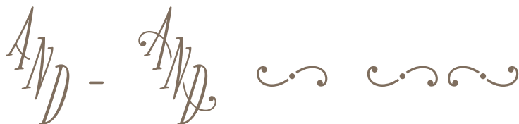
Standard Ampersand and Hyphen vs. Custom Alternates found by enabling Stylistic Alternates

You can also use custom a custom designed Ampersand and Hyphen in Voyeur Monogram which requires the Stylistic Alternates feature, available in most OpenType savvy applications, such as Adobe Illustrator CS (see Fig. 1).