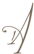
Type any Capital letter