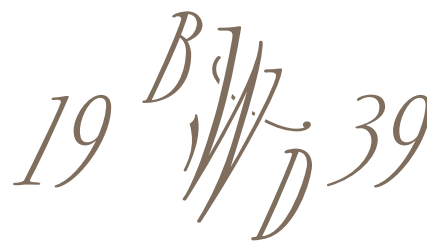
Type any lowercase + Capital + lowercase surrounded by numbers (or any 3 lowercase letters with Ligatures enabled)

Voyeur Monogram's also includes a unique feature to make this normally monogram constrained typeface usable for headlines and titles. With the SmallCaps feature enabled, the diagonal monogramming sequence is substituted for baseline aligned smallcaps. (See the example below.)