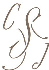
Type any lowercase + Capital + lowercase (or any 3 lowercase letters with Ligatures enabled)