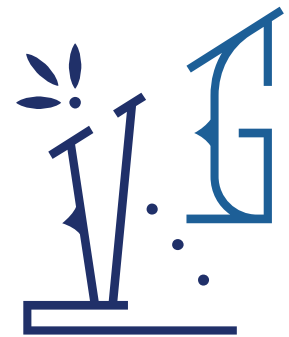
Type V then g