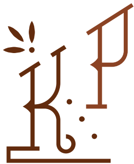
Type K then p

If you want to add a little style to this straightforward monogram, try playing with tonal colors to create an illusion of fading or contrasting colors for a playful vibe. Set one color for the Capital letter, and a different color for the lowercase letter. (see the examples below)