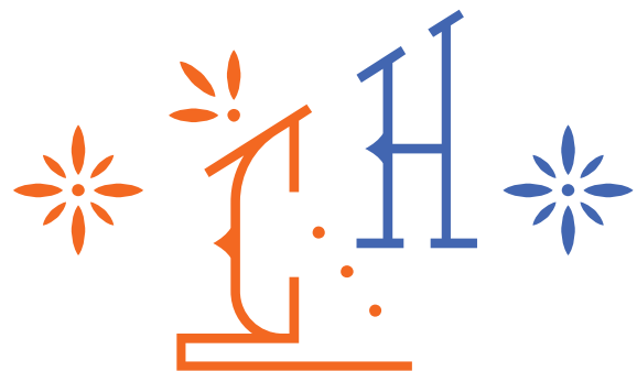
Type . C then h . (periods add basic floral ornamentation)