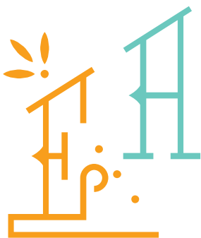
Type E then a